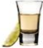
1 Shot of Liquor (Whiskey, Vodka, Gin, etc.) 1.5 oz.

Before or during sex the last time you had sex with [INITAILS/NICKNAME], how many alcoholic drinks did you have?